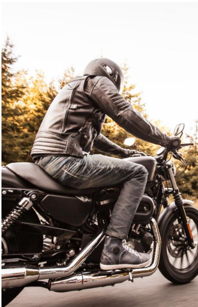
A dark-clad motorcyclist on a black bike.

Roughly 95% of motorcycle accidents are survived. But 80% of motorcycle riders involved in a crash suffer serious injuries. In other words, only 1 in 5 riders escape a crash without suffering serious or fatal injuries.