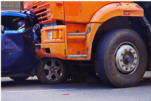
Orange truck smashes into the back of small, blue car.